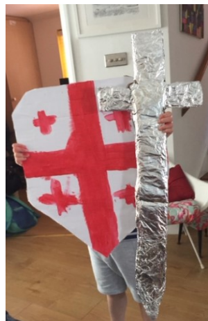
Leo's sword and shield.