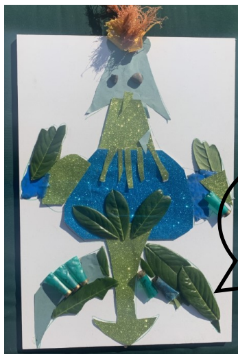
Alaia's dragon from natural objects and things from the craft cupboard.

Here are some pictures of the activities the children have done as part of the St George's Day Challenge. Well done everyone. I'm really proud of your creations.