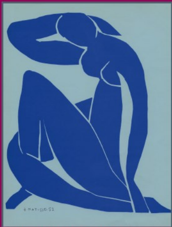
Henri Matisse - Nu bleu II (Blue Nude II) , 1952 - lithographic reproduction © Succession H. Matisse/DACS 2018 Image from The Hayward Gallery

BRAINTREE DISTRICT MUSEUM, MANOR STREET, BRAINTREE, CM7 3HW FOR MORE INFORMATION PLEASE CALL: 01376 328868 ADMISSION CHARGE APPLIES OPEN: TUESDAY TO SATURDAY 10AM - 4PM