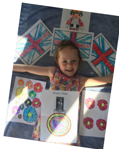
Poppy coloured in lots of pictures.