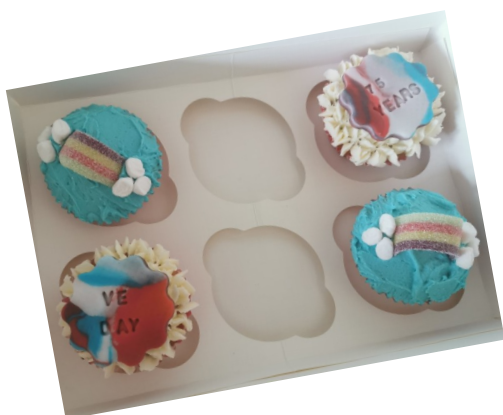
Ethan D made some cup cakes.